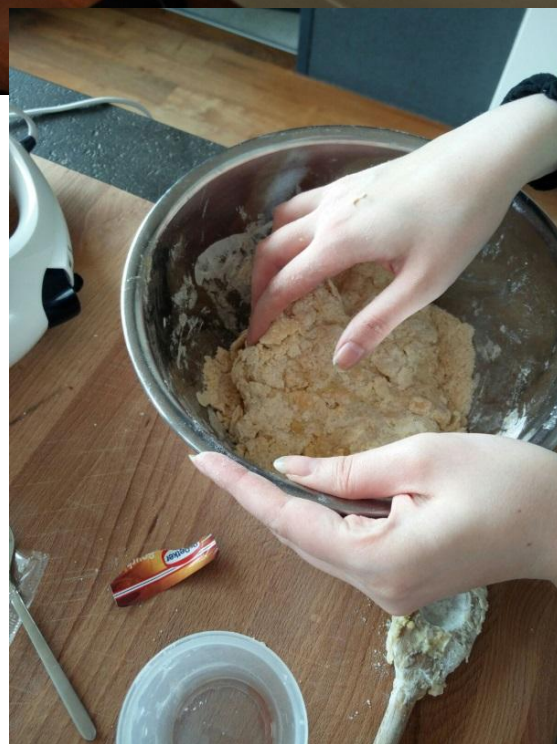
Alle Zutaten zu einem Teig verrühren.