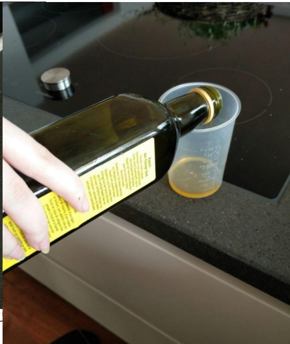
Eier und Eigelb, Öl, Hefe hinzufügen